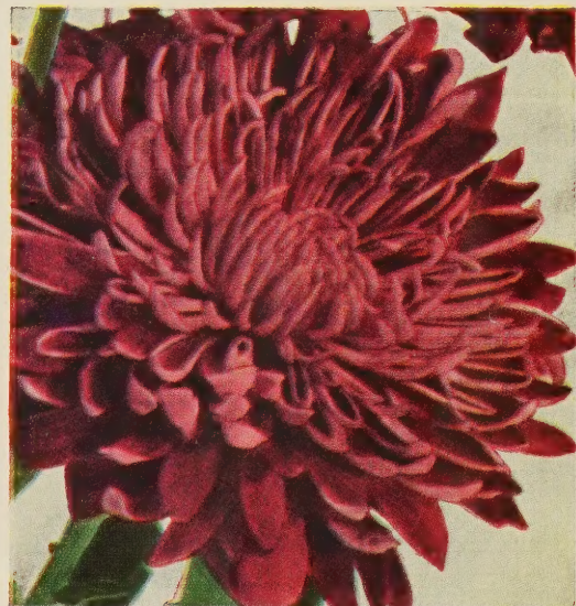
CHIPPEWA. 50c each; 3 for $1.25

6 Summer-Blooming MUMS A selection that always beats the early frosts. All early and dependable. 6 Sure-to-Bloom Plants $2.70 (1 of each pictured)